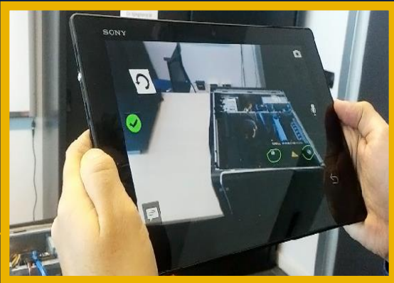
Augmented Reality - remote maintenance