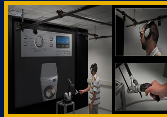
Haptics for product experience design